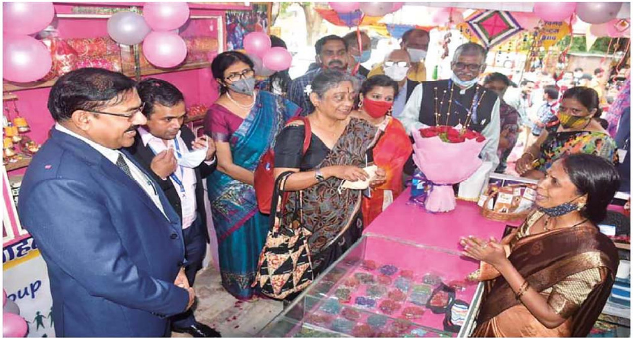
SHOP VISITED BY SHREEMAN CHAIRMAN OF NABARD AND CGM OF NABARD

थोड़े समय बाद हमने अपनी जमा पूँजी से एक दुकान खोली जिसमें हमने महिलाओं द्वारा हाथ से बनी चीजें जैसे की खाद्य सामग्री, आचार, पापड़, नमकीन, दीये, कपड़े, चादरे, कालीन, अगरबत्ती, इत्यादि बेचने लगे और थोड़े समय बाद धीरे-धीरे खरीददार मिलने लगे और हमारा सामान धीरे-धीरे बिकने लगा तथा हमारे रोजगार के लिए आवंटन राशि मदद के तौर पर मिली जिससे हमारे रोजगार को सुचारु रूप से चलाने में काफी लाभ मिला उस राशि को हमने निवेश करके दुकान में सामान बढ़ाया जो ग्राहकों की डिमांड थी।